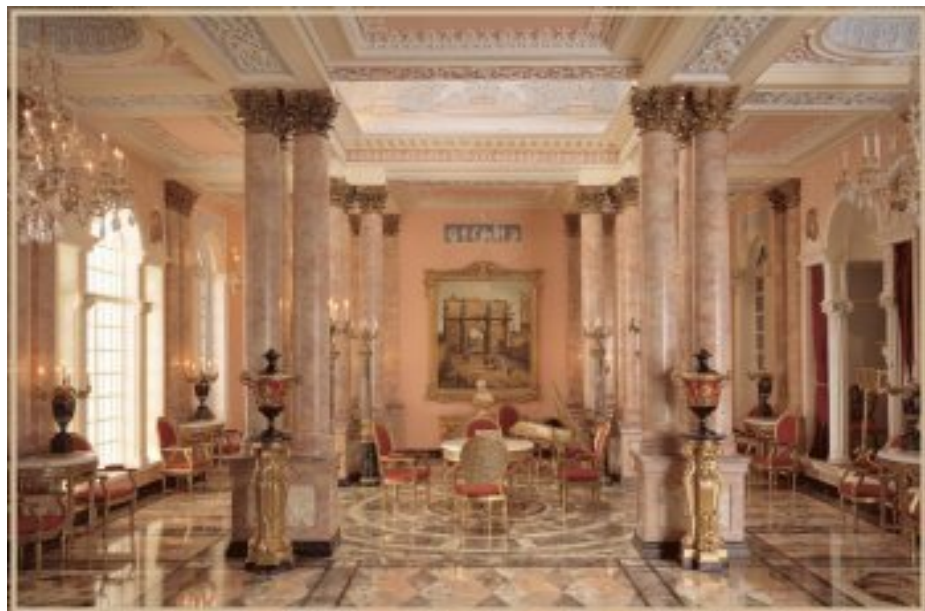
Ron Hubble: The Ballroom in the Miniature Museum of Taiwan