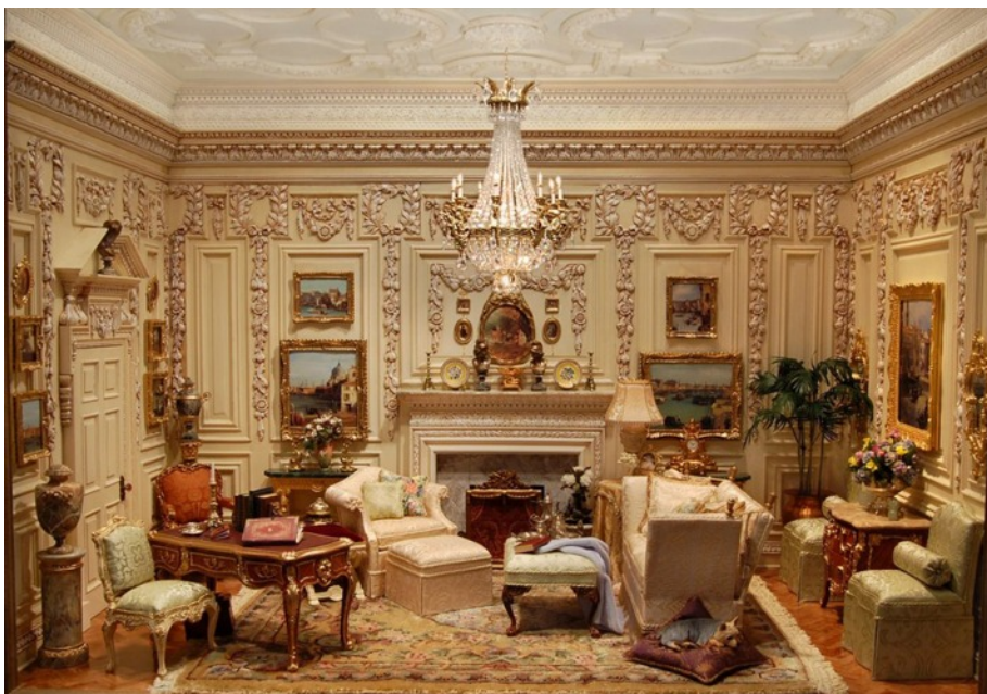
Ron Hubble: Masterpiece Collection-Jacobean Drawing Room